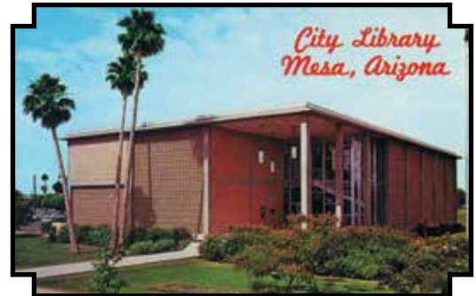
1963, Mesa City Library

Note the original light fixtures on the porch and the floating terrazzo staircase which can be seen in the foyer. The building is on the Mesa Historic Property Register.