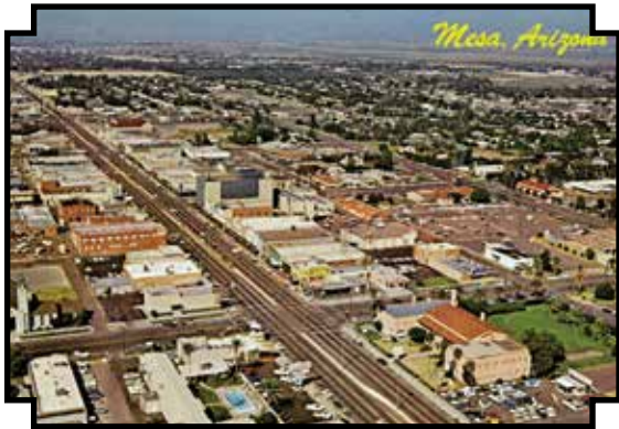
Mesa Coliseum and Maricopa Inn, circa 1950 Northeast corner of East Main and Center

In 1928 the El Portal Hotel was on this property, but the name was changed in 1945 to Maricopa Inn. During baseball spring training games in Mesa, it was home to several major league baseball teams. In 1975, the multistory First National Bank building replaced it. It is now the Mesa City Plaza.