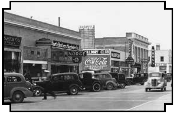
Waldorf Cafe circa 1935

The Noonan Building stood on this site during the 1880s and served as Mesa's first social hall, as well as a butcher shop and Mesa's first Post Office.