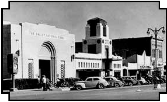
Valley Bank Building, Tower Building, Ritz Theater, Barnett Building – 1943