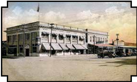
Salt River Valley Bank, circa 1922

In 1920, the bank's doors opened for business, but the Valley Bank moved across the street to 60 West Main in 1932. By the early 1960s, Arizona Bank was established here, and in 1978, they razed the building pictured above and replaced it with the current building. The Arizona Bank installed the kachina stained glass window.