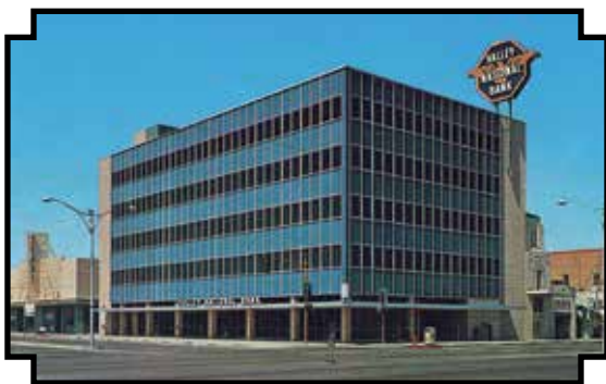
Valley National Bank Building 1960

In 1920, the Salt River Valley Bank was located at 61 West Main. Known later as the Valley Bank and then Valley National Bank, it moved across the street to this corner at 60 West Main in 1932. In 1959, the building pictured above was demolished and replaced by a five story blue building. By the mid 1990s when the Valley National Bank was no longer the occupant, the façade was changed.