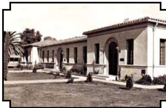
City Hall, circa 1948

(Arizona Museum of Natural History) The first City Hall, which was a small adobe structure, and a building which replaced it in 1912 were on this property. In 1937, the WPA building shown in the photograph was constructed and included the city offices, police department, and library. The fire department was adjacent to it. You can still see the original entrance in the lobby of the museum.