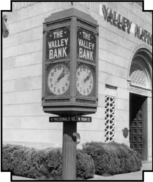
Town Center Clock NE Corner of W Main and Macdonald

Two tours are included in the pamphlet. Each one begins at the City Plaza, 20 E Main, and will take approximately one hour. The routes are shown on the map.