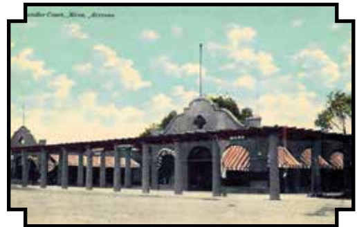
Chandler Court, circa 1910