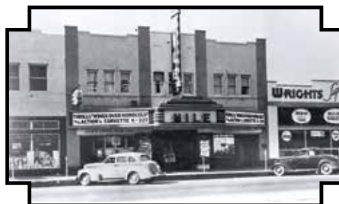
Nile Theater, Wright's Super Market circa 1935

Opened in 1924, this was Mesa's first air-conditioned building. Blocks of ice were put in a container in the back of the building and a large fan behind the ice distributed the cool air to vents under the theater seats. The theater existed until 1951.