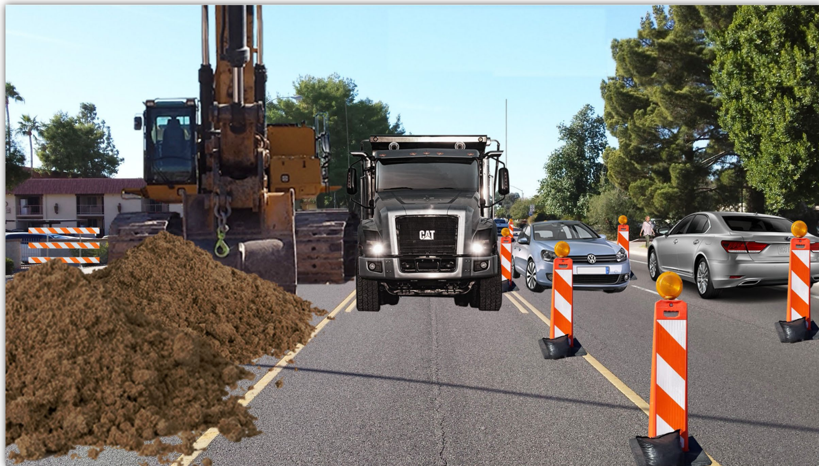
Typical traffic control during construction