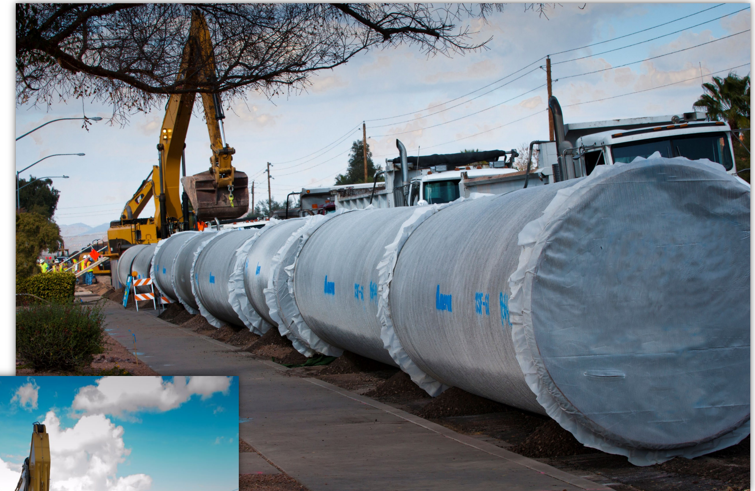
Pipe staged in roadway and excavation of trench