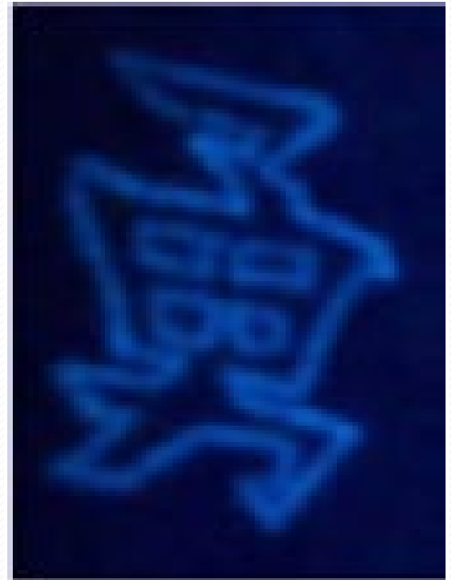
Under UV Light

In September 2006, the Latino Gang Investigators' Association indicated that some Latin King gang members have had black light tattoos placed on their bodies so that law enforcement will not be able to easily identify them.