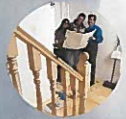
Tread carefully. Stairways should be well lit and have handrails.

If needed, the volunteer will provide you with batteries and a smoke alarm(s).