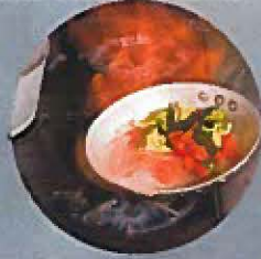
Cooking fires are the #1 cause of home fires and home fire injuries (NFPA.org).

The HSE Program aims to reduce the risks of fires and falls within the home and to link citizens to outside resources as needed.