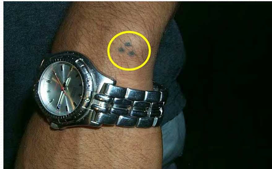
The three dots...Mi Vida Loca – My Crazy Life