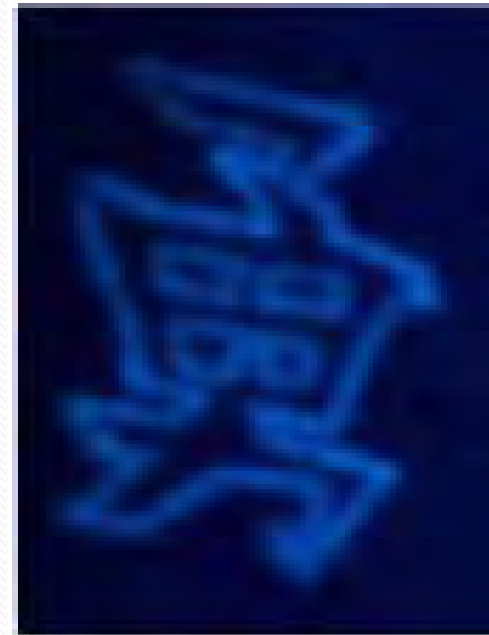
Under UV Light

In September 2006, the Latino Gang Investigators' Association indicated that some Latin King gang members have had black light tattoos placed on their bodies so that law enforcement will not be able to easily identify them.